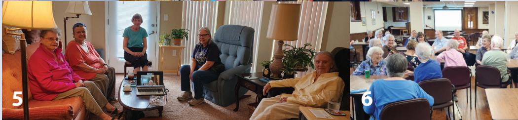
6: The discussion on Pilgrims of Hope brought together Dubuque associates, discerners, and BVMs.