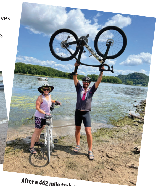
After a 462 mile trek, mom and son victoriously celebrate the end of the ride, after dipping their front tires in the Mississippi River, at Lansing, Iowa.