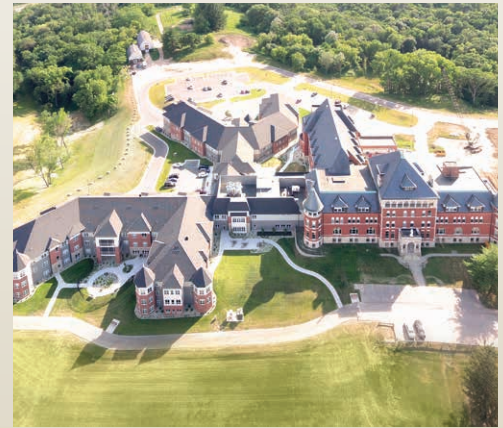
Mount Carmel Bluffs as of Summer 2021