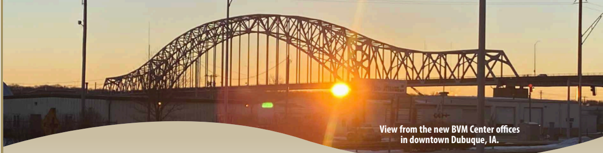
View from the new BVM Center offices in downtown Dubuque, IA.

BVM Associate News will be emailed and posted on the associate page of the members' website. Copies mailed on request.