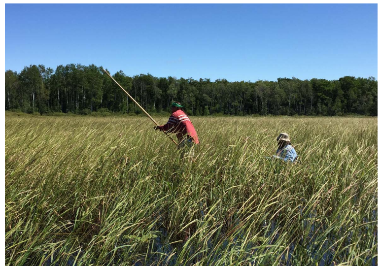
Wild Rice Harvest, Flowage Lake, August 2015

Enbridge's Line 3 has already faced 2 years of fierce resistance in the Great Lakes, led by Ojibwe tribes and grassroots groups like Honor the Earth, MN350, and Friends of the Headwaters. For 4 years, we fought the proposed Sandpiper pipeline, which would have established the new Line 3 corridor. Eventually, MN combined the Sandpiper and Line 3 applications into one regulatory process, and a successful 2015 Friends of the Headwaters lawsuit forced them to conduct a full, cumulative Environmental Impact Statement (EIS) on both lines. In August 2016, we defeated the Sandpiper , but the battle against Line 3 remains. Minnesota is currently writing its EIS for Line 3, after months of battle over what the study would include and who would perform the analyses. The draft EIS is scheduled for April 2017 and the public will be able to comment at public hearings. A final permit decision is expected in Spring 2018.